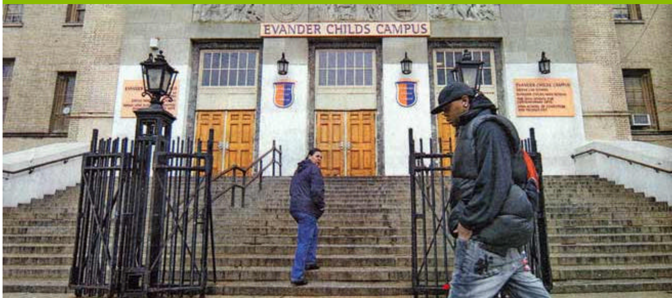
Ex-Problem - My old school, Evander Child High School, in the Bronx, was an "impact school", getting the attention of specialists in public security, the police, and school safety local agents to reduce violence and disorder.

The next articles on school reform in this series by the staff of the Fernand Braudel Institute of World Economics will be published on alternate Sundays in O Estado .